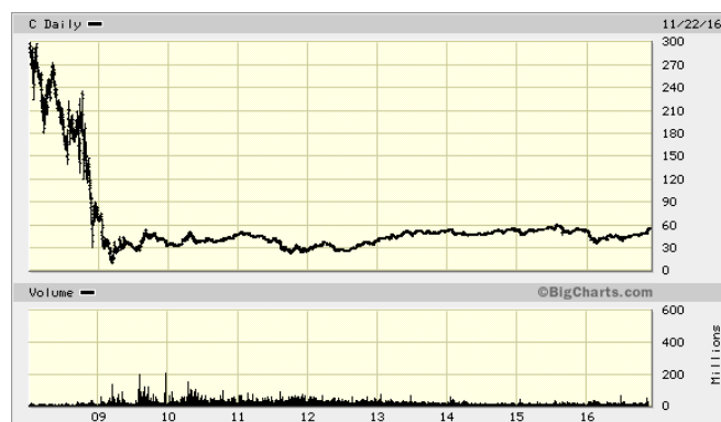
C Chart from 12/31/2007 to 11/22/2016