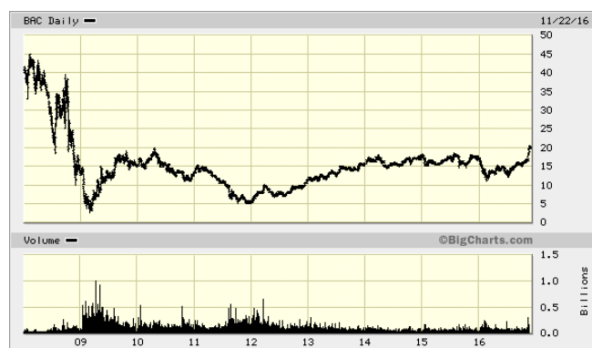
BAC Chart from 12/31/2007 to 11/22/2016

Bank of America's revenue is up by about $15 billion. Their profits are higher than they were in 2007 and their balance sheet equity has almost doubled, but their stock has been cut in half. Citi's improvement in their numbers isn't quite as good as BAC's, but I still don't think the fall in their stock of over 80% makes a lot of sense.