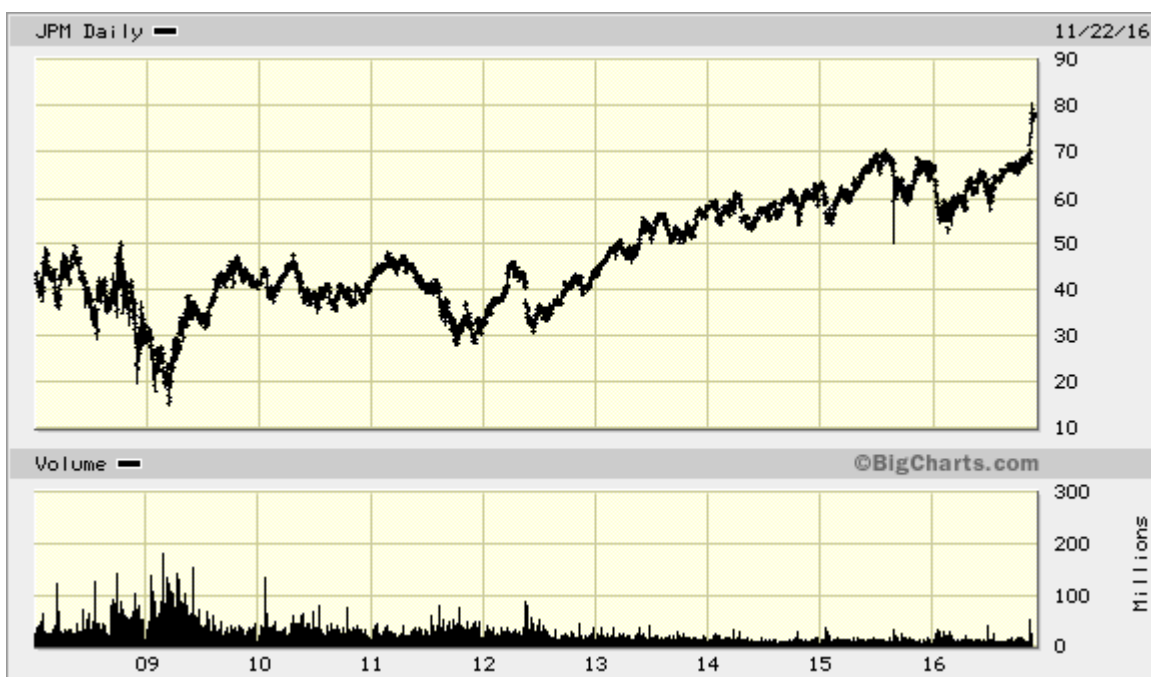
JPM Chart from 12/31/2007 to 11/22/2016

First off, the only stock price that has appreciated since 12/31/2007 is JP Morgan's. In fact, it is up 79.9%. Which makes sense when you consider they have grown revenues by about $25 billion. Their profits are up almost $9 billion. And their balance sheet equity is up over $100 billion.