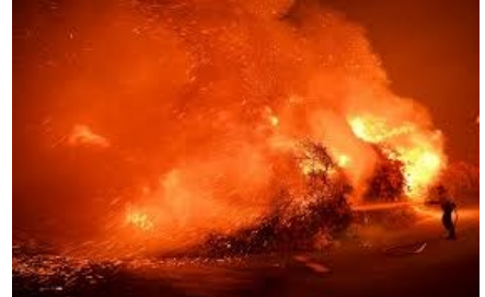
Massive wildfires devastated Southern California