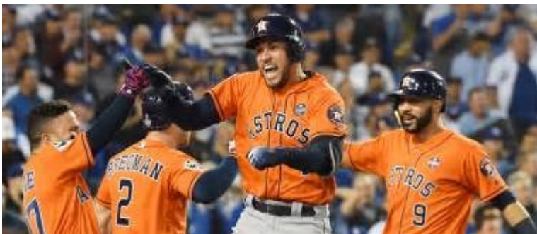
The Houston Astros won the World Series!