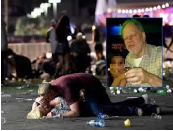
10/1/2017 saw 58 people killed and 546 injured when gunshots rang out into the crowd of a Las Vegas concert.