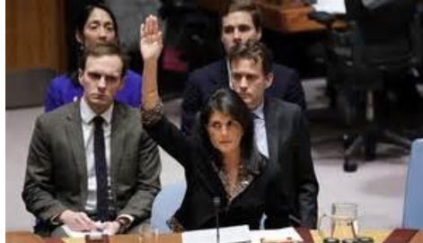
12/6/2017 The USA formally recognized Jerusalem as the capital of Israel.