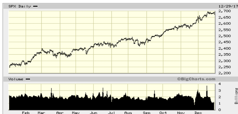
S&P 500 2017 Chart

Factoring in the extremely low-reading in the Volatility Index and the fact that the market didn't show any downside moves of significance highlights the strength of this rally.