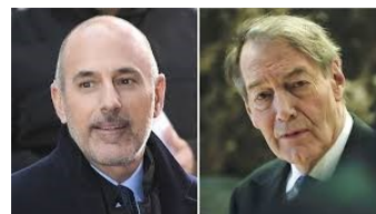
Major Hollywood Power Broker, Harvey Weinstein, was accused of being a serial sexual predator by MANY women. After that, an avalanche of powerful men in Hollywood, politics, and entertainment were also accused of being serial sexual assaulters.