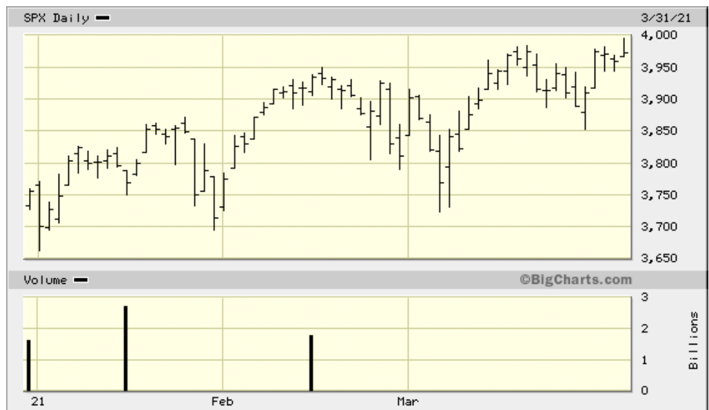
S&P 500 2021 Chart

As we mentioned in the last newsletter, we had a lot of confidence regarding the markets as we headed into 2021. So far, it appears our feelings were justified. In the 1st quarter, the S&P registered a price change of +5.77%. During this move, the market was very steady and resolute in its movement. There wasn't a lot of flash, nor was there a lot of glamour. Instead, we simply saw consistent gains.