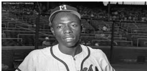
January 22nd, the legendary Hank Aaron passes away