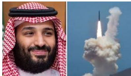
February 4th, Biden Administration ceases supplying weapons to Saudi Arabia