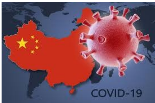
February 9th, WHO concludes that COVID was likely to have come from bats not a Chinese lab in Wuhan.