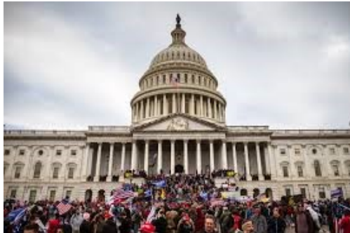
January 6th, Capitol Hill swarmed by protestors in response to the election process