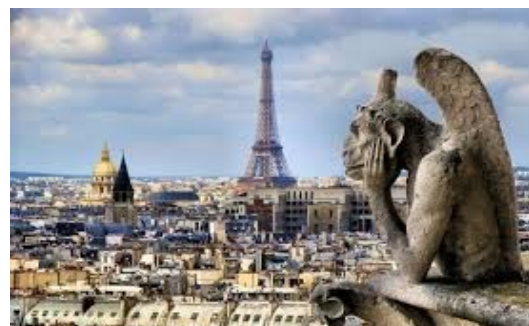
February 19th, America officially rejoins the Paris Climate Accord