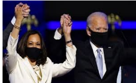
January 20th, Biden/Harris sworn in as President and Vice-President