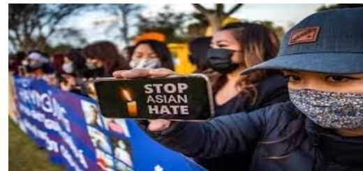
Violence against Asian-Americans began occurring due to anger over COVID