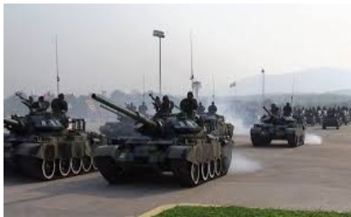
February 1st, a coup takes places in Myanmar